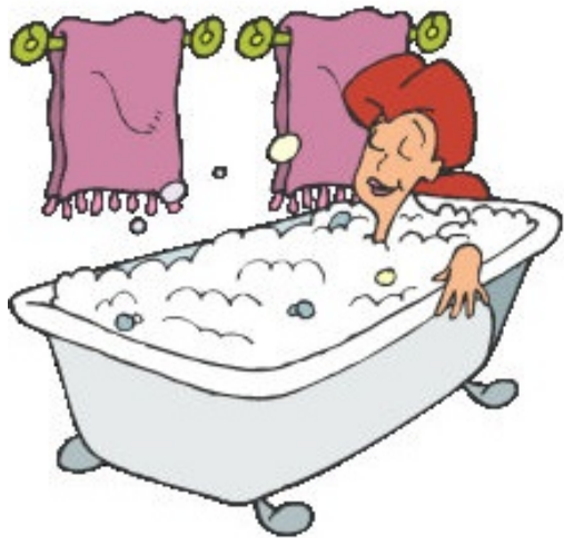
Have a bath