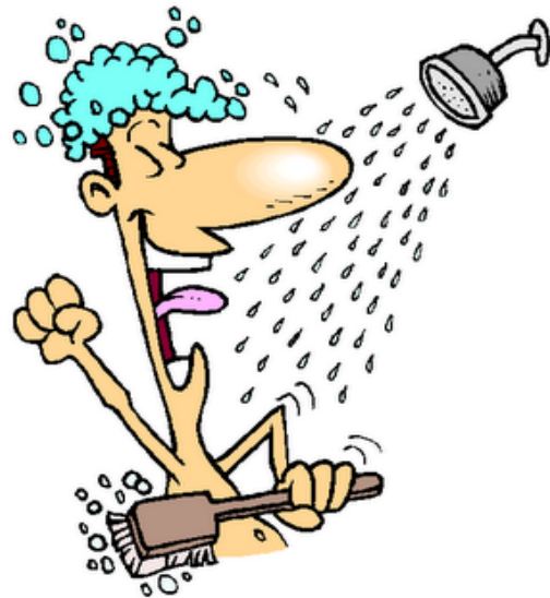
Have a shower