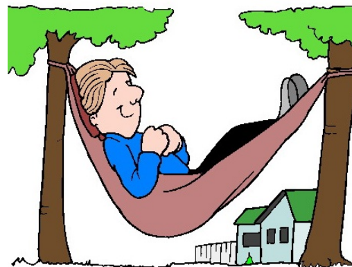
Have a rest